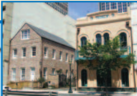
6 Bedsole Complex 6-8 St. Joseph St.