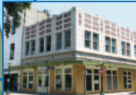
19 St. Emanuel Place Dauphin and St. Emanuel streets