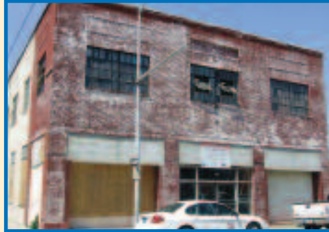
17 St. Louis Lofts 308 St. Louis St.