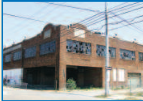
32 Buick Building St. Louis Street