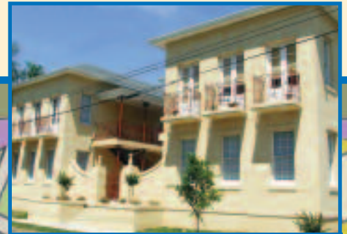
1 Claiborne Apartments 258 N. Claiborne St.