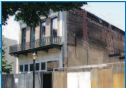
11 Dauphin St. & Crescent Theatre 208 and 210 Dauphin St.