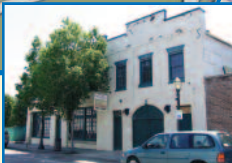
22 The Carriage Works 709 Dauphin St.