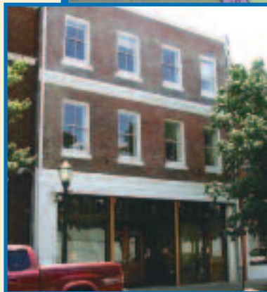
2 Dauphin Street 459 Dauphin St.