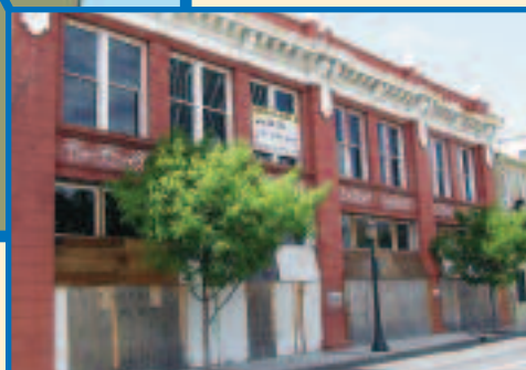
14 Central Optical St. Emanuel St.