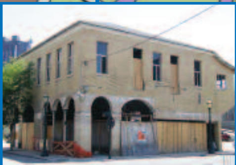
15 Parkside Home and Garden Conti and St. Emanuel streets