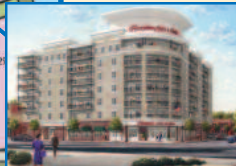
27 Hampton Inn Royal Street